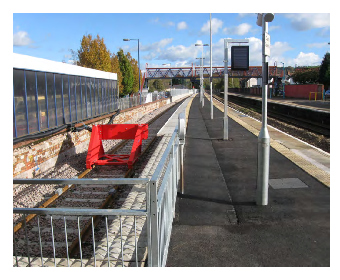
New bay platform at Caerphilly

Users of the A55 (the main east — west road from the English border to Holyhead) can testify from their own experience that few HGVs comply with speed limits such as that of 50 mph through Colwyn Bay. With so much corner-cutting, it's not surprising that road haulage continues to undermine rail freight. In north Wales, the safety problems on the A55 should justify a more concerted effort to reintroduce revenue-earning rail freight, especially for the major movement of freight through Holyhead ferry port.